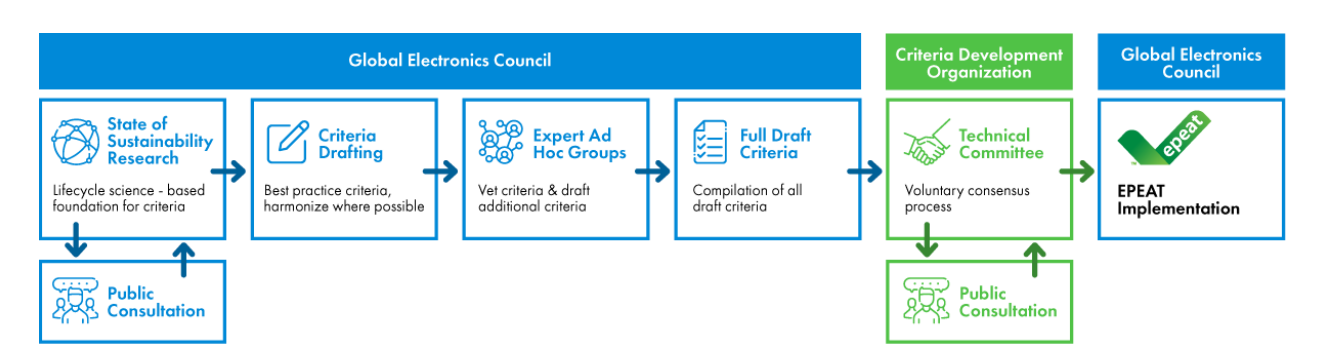
Figure 2: Steps in Criteria Development Process

Each of the steps in the process are described in more detail below.