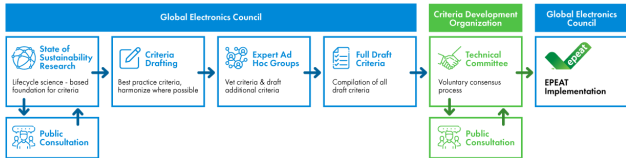
Figure 2: Steps in Criteria Development Process

Each of the steps in the process are described in more detail below.